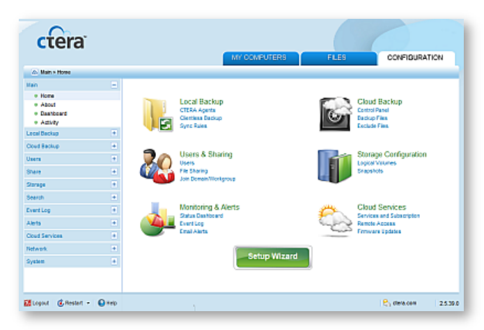
CTERA's easy-to-use, browser-based user interface